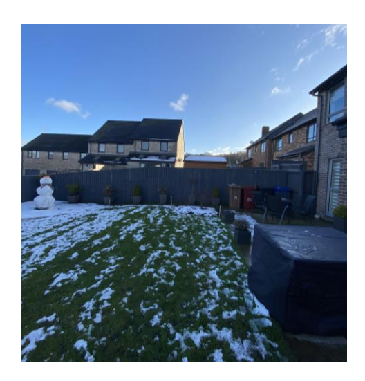
Above: Views from rear garden area of application site looking towards 5 Fern Crescent (left), 7 The Fallows and 9 The Fallows (right).