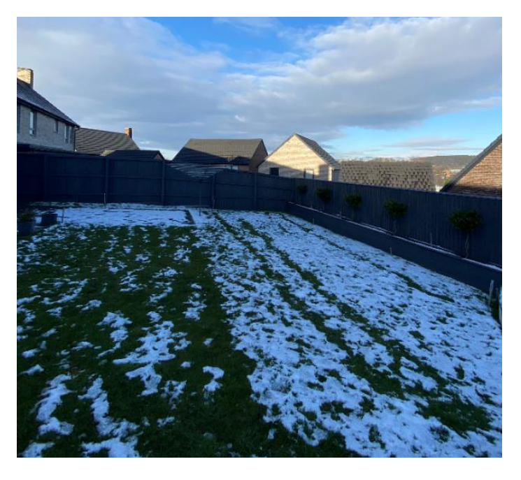
Above: View towards north-western and northern boundary or rear garden

3.5.4 The overall height of the proposed garden room will only protrude the height of the boundary treatment by circa 0.5m. In addition, the proposed garden room will be positioned 1 metre away from the party boundary fence of the adjoining properties. Taking this into consideration the proposed development will not harm the amenity of the occupants of the aforementioned dwellings in terms of loss of light, and dominance, as the fence dividing the properties will screen a large proportion of the outbuilding thereby acting as a mitigating factor.